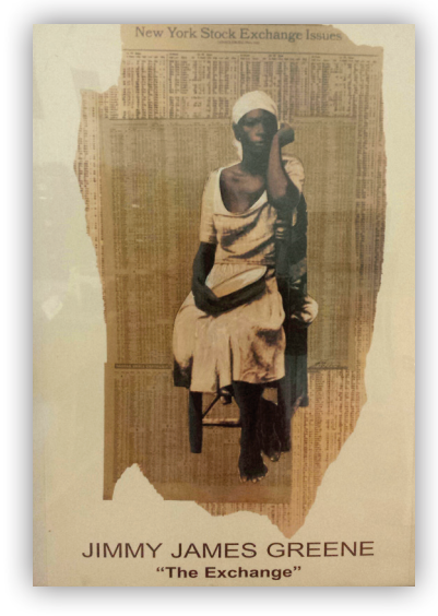
They Stole Us! They Sold Us! They Owe Us!