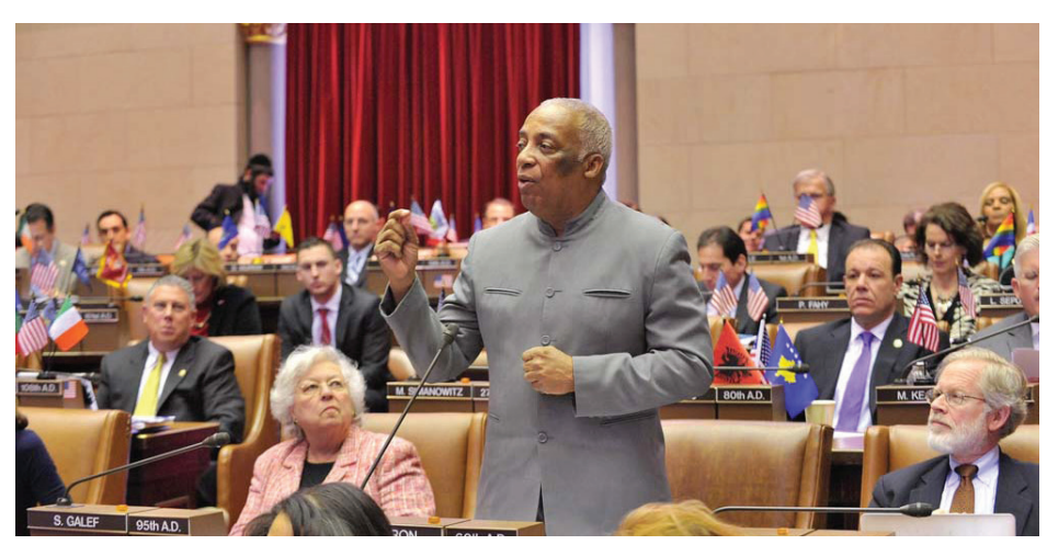
Assembly Member denounces the State Budget and demands an equitable and fair alternative.