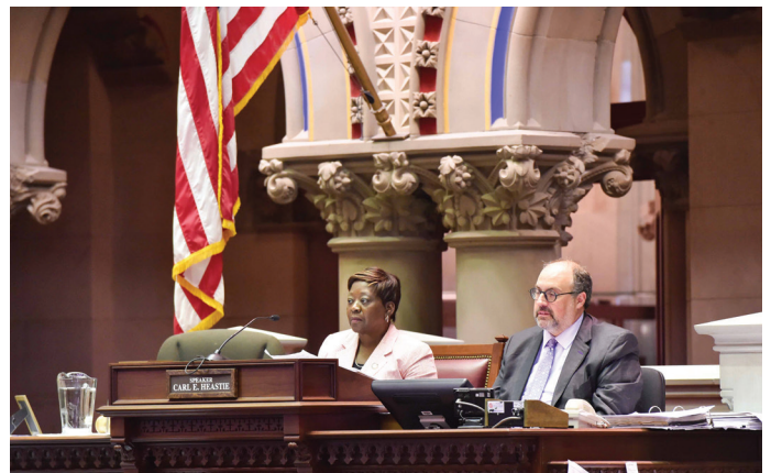
Assemblymember Peoples-Stokes at the rostrum inside Assembly Chambers, temporarily serving as Speaker Pro Tempore leading legislative floor proceedings.

Establishes the Lupus education and prevention fund and outreach program and provides taxpayer gifts for lupus education and prevention.