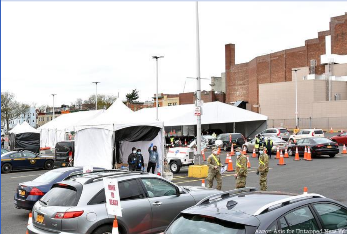
Drive through testing site at Sears Parking lot