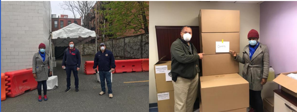
Assemblymember Rodneyse Bichotte at the COVID-19 walk-in testing site in Flatbush. Assemblymember Bichotte partnered with Governor Cuomo's office, One Brooklyn And Morris Heights Health Center to open this site