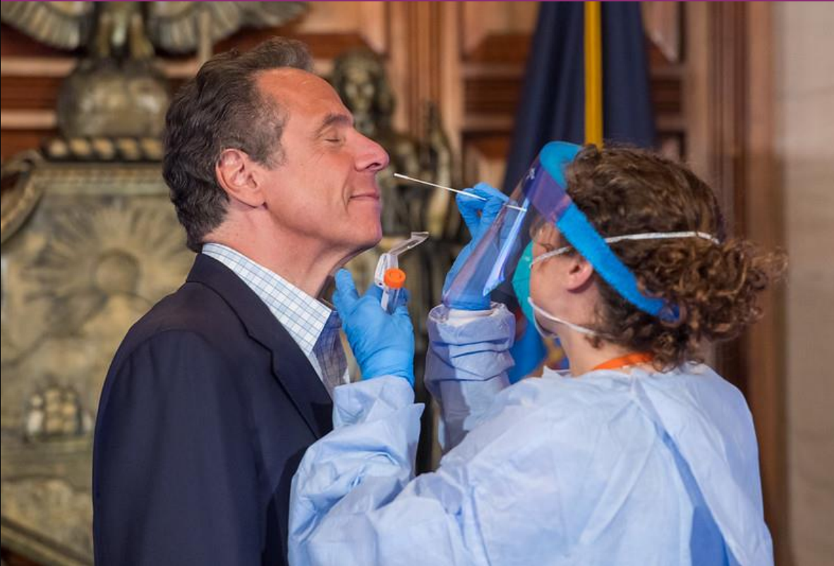
Photo Credit: Governor Cuomo; Governor taking a COVID-19 test today during his briefing.