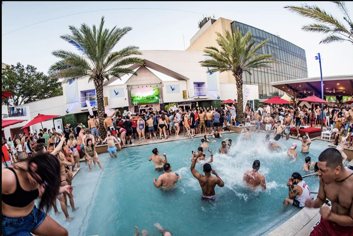
Photo Credit: Cle Houston/Facebook - Houstonians ignore social distancing guidelines over the weekend.