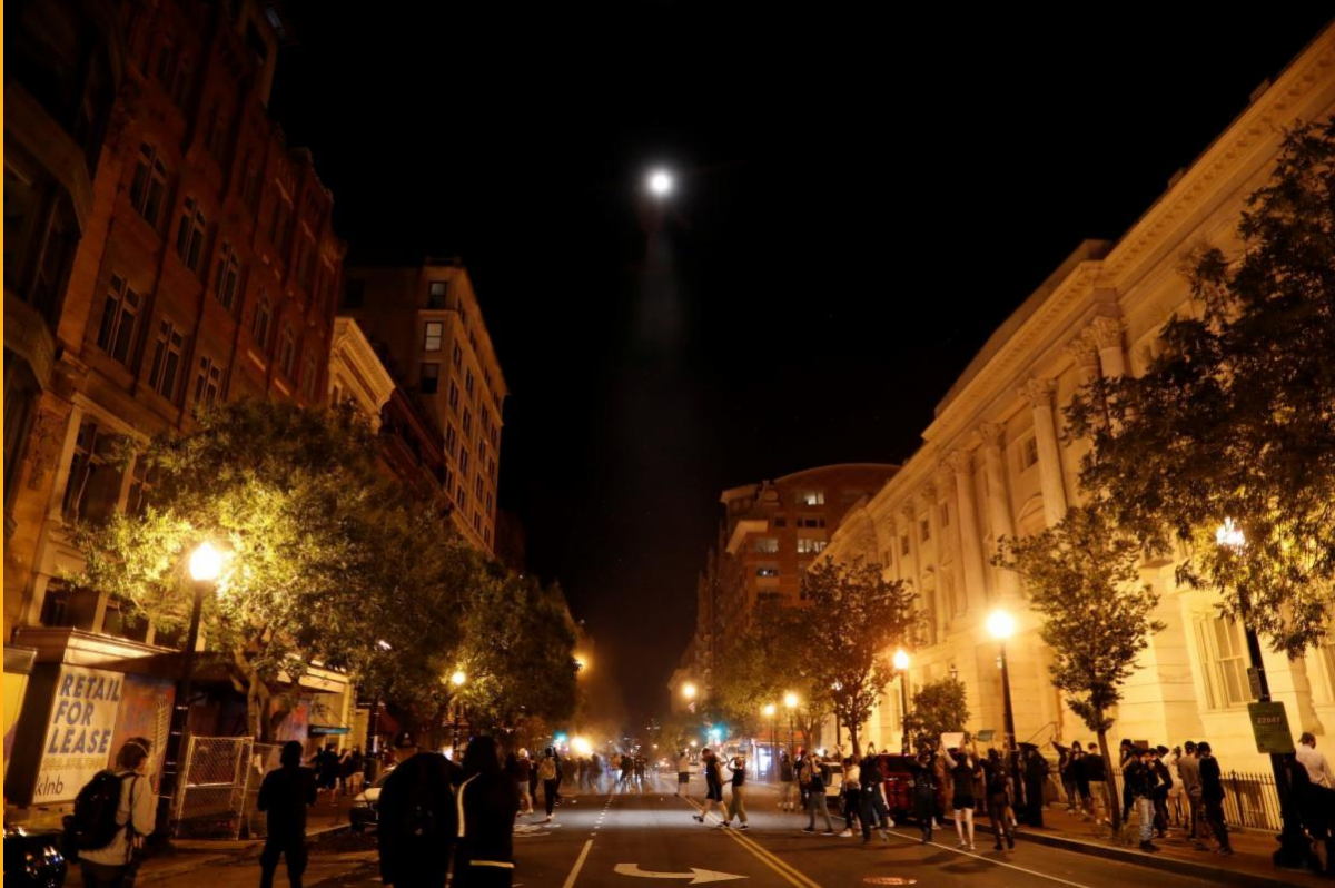
A helicopter monitored protesters above Washington tonight.