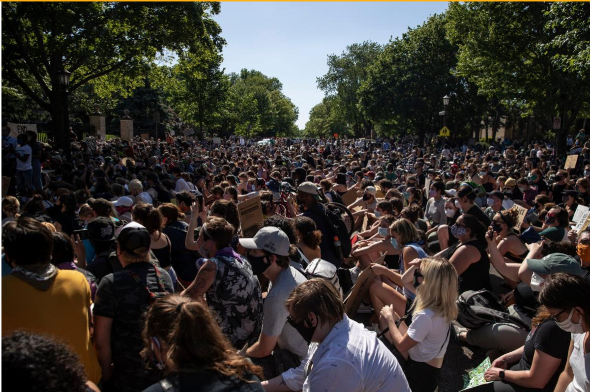
Protesters sat in the street outside the Minnesota governor's residence in Minneapolis.