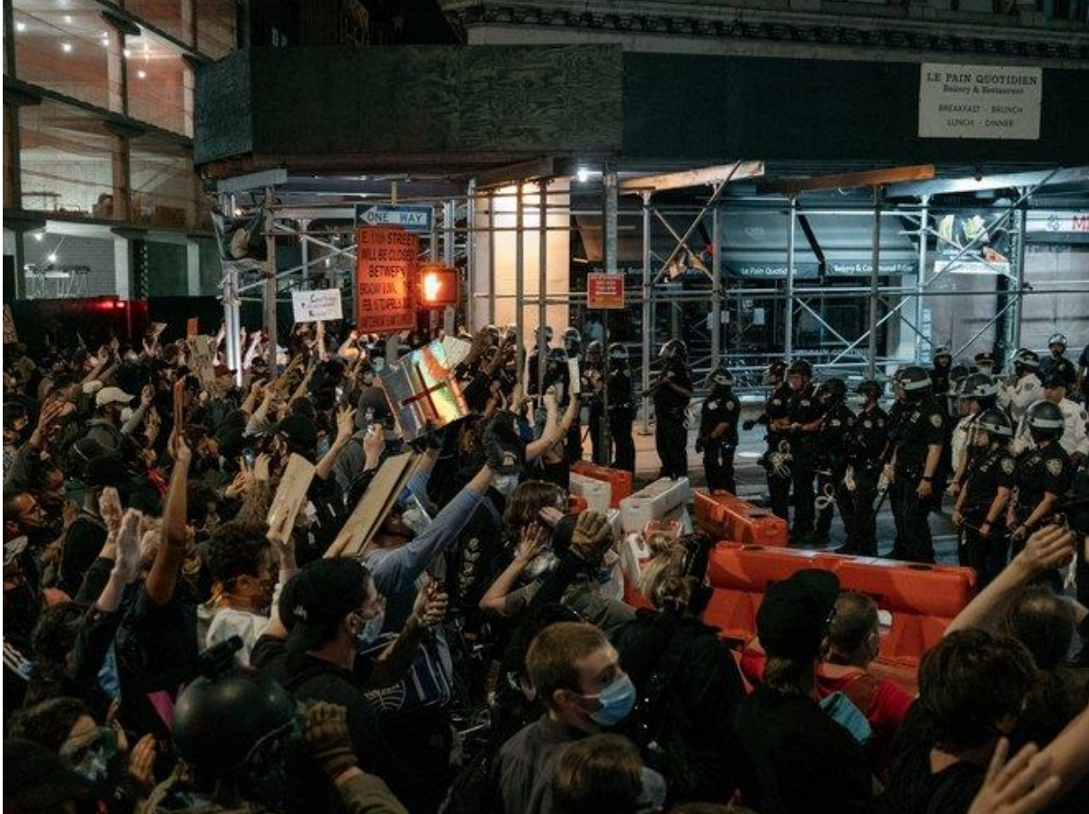
Demonstrators face off with police on a Manhattan sidewalk, May 31, 2020