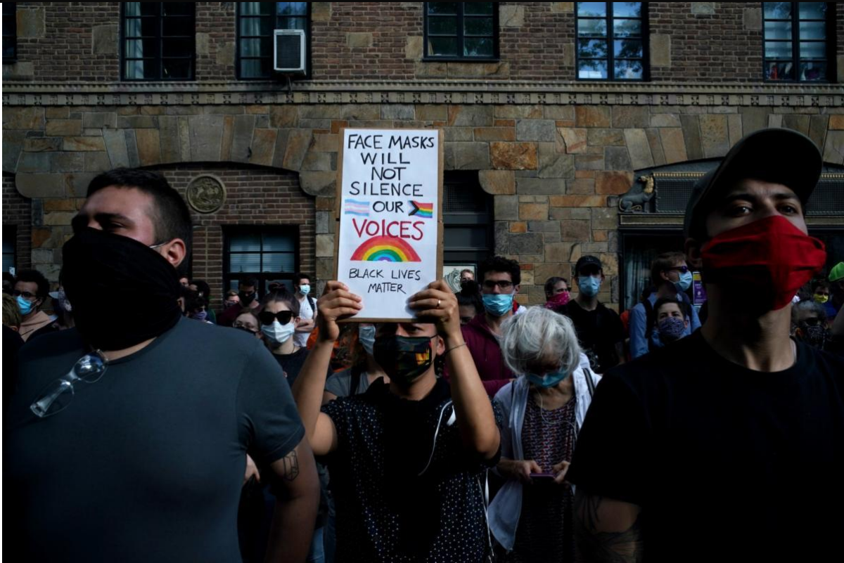
A vigil in Sheridan Square, outside the Stonewall Inn.