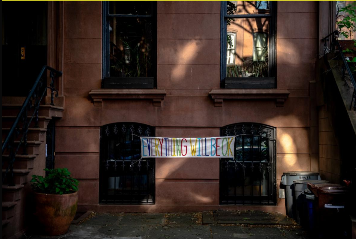
A sign hangs in Brooklyn as the city prepares to begin reopening.