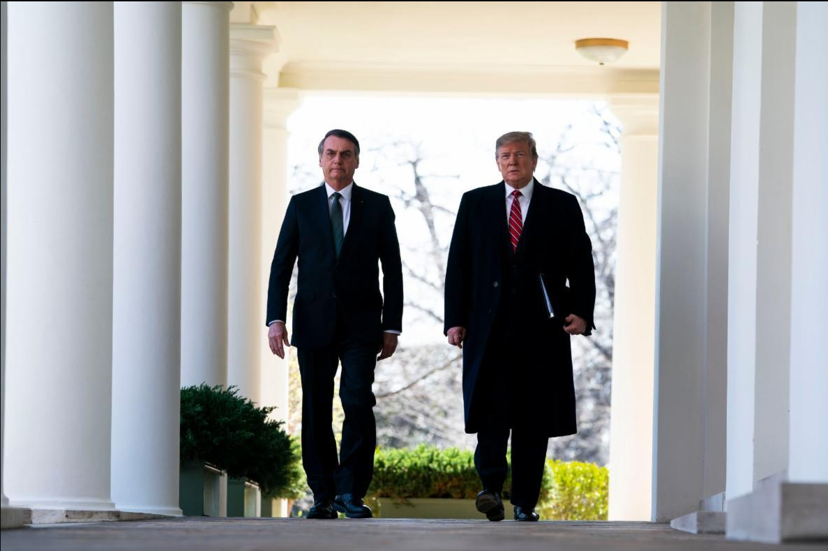
Brazilian President Bolsonaro and President Trump.