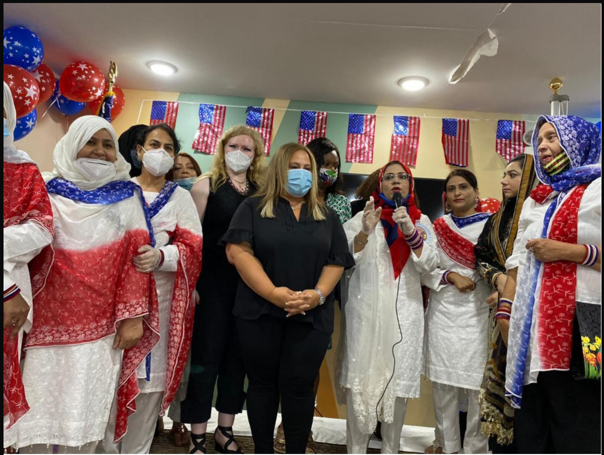
Photo of the PASWO July 4th event.