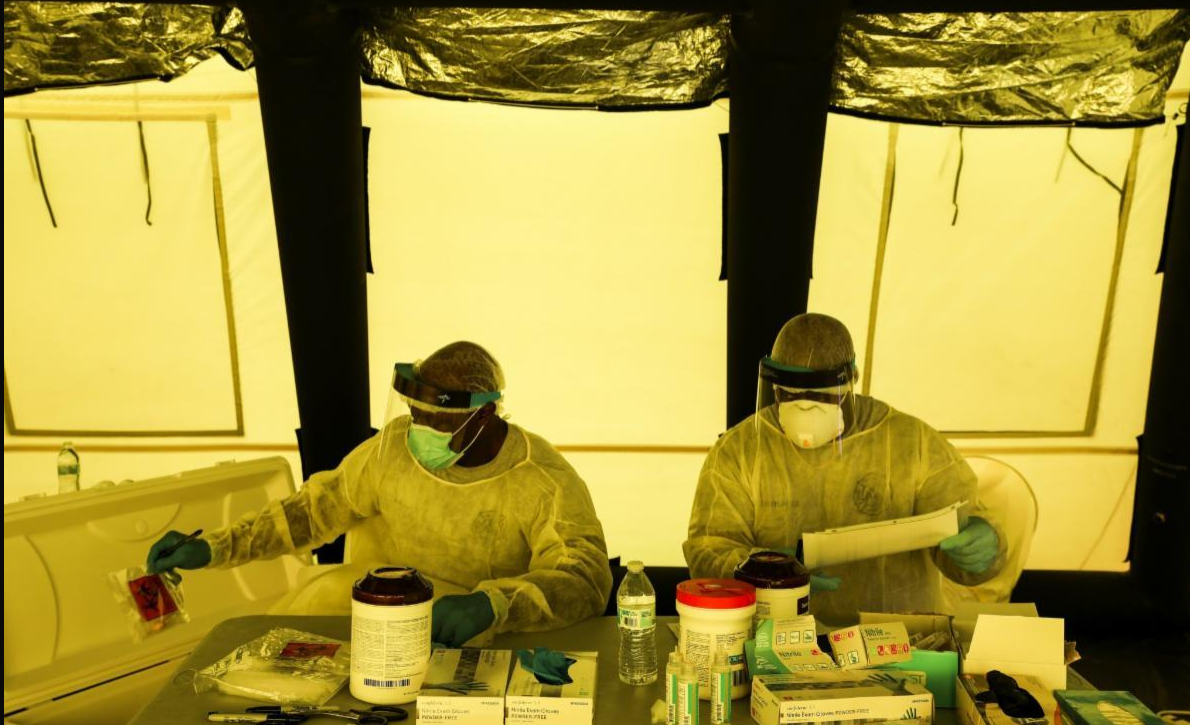
Photo Credit: Eve Edelheit/ The New York Times. Medical workers organizing tests in Orlando, Florida, where cases of the virus are surging.