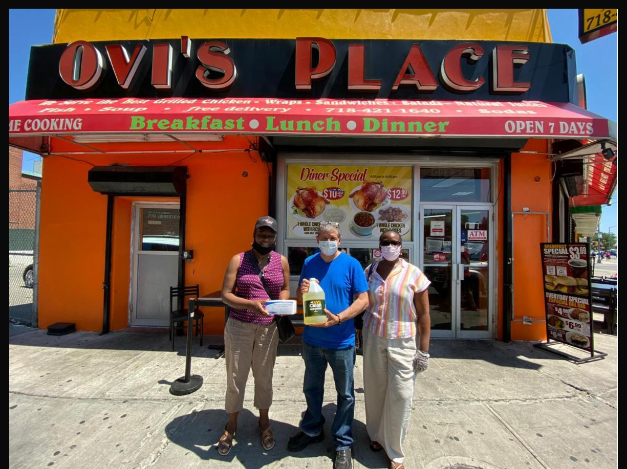
Assemblymember Rodneyse Bichotte at Ovi's Place.