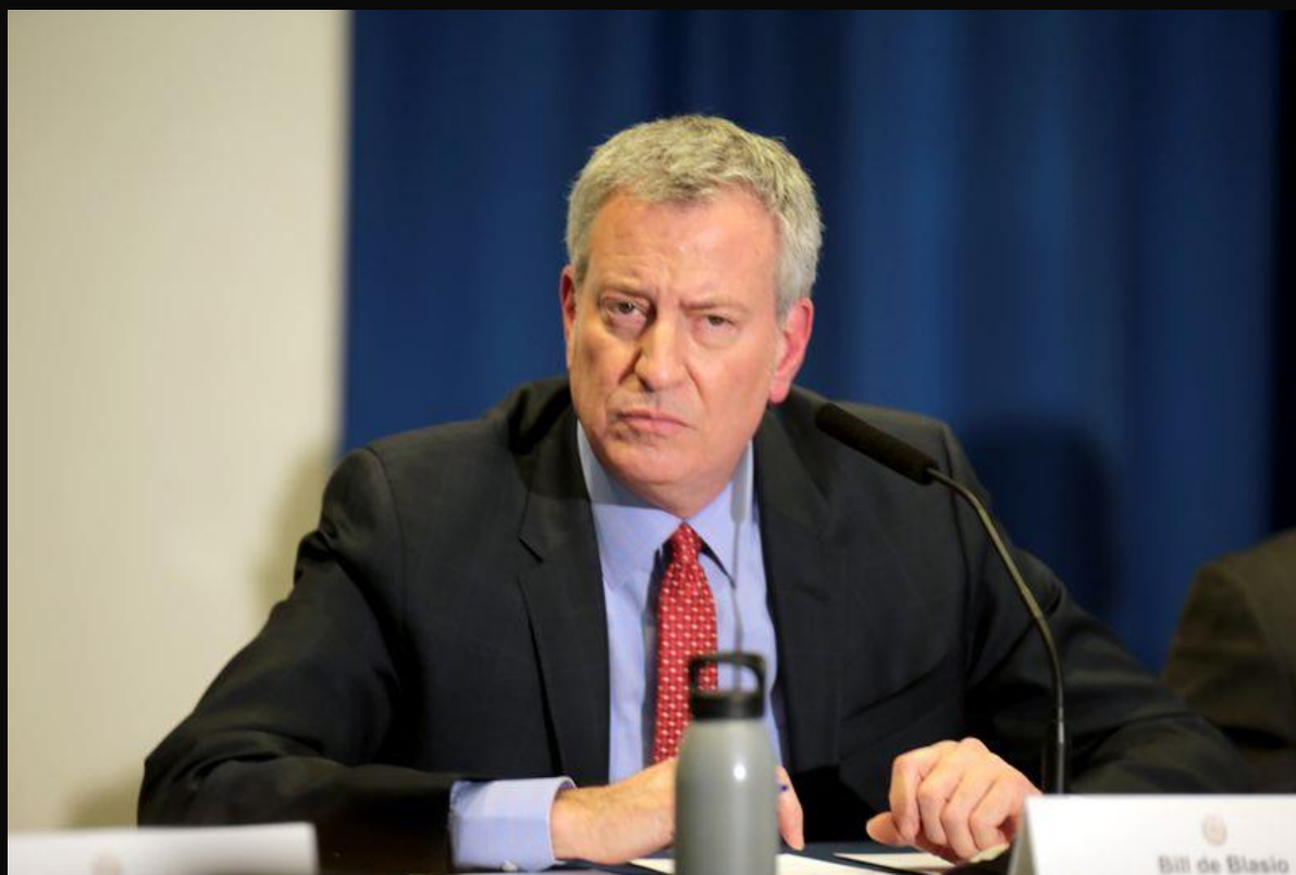
Photo Credit: NYC Mayor Bill de Blasio (Luiz C. Ribeiro/for New York Daily News)