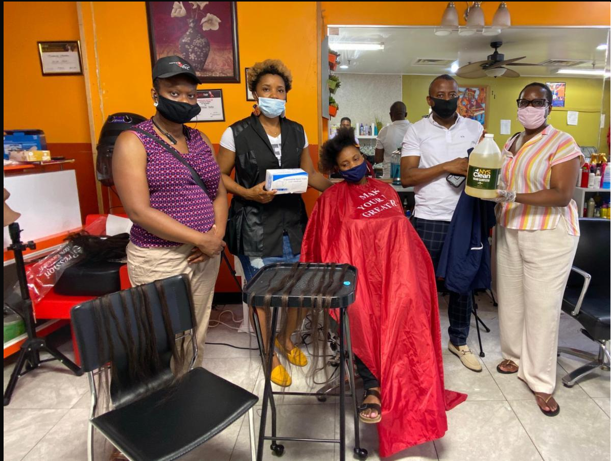
Assemblymember Rodneyse Bichotte at L&L Unisex Beauty Salon.