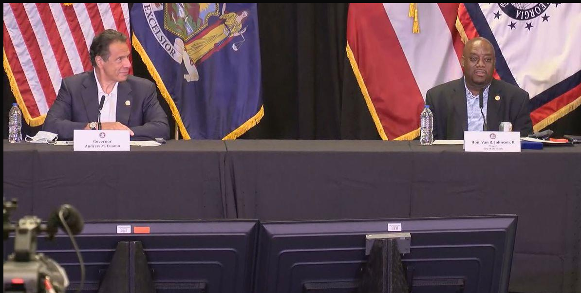
Governor Cuomo with Savannah Mayor Van Johnson.