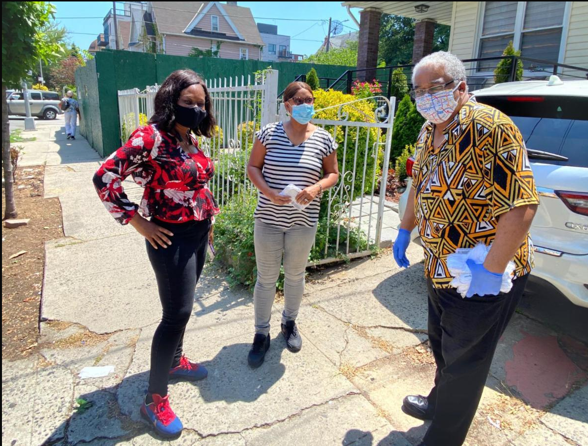
Assemblymember Bichotte giving out PPEs to constituents on Farragut Rd between East 31st & 32nd.