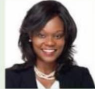
Assemblymember Rodneyse Bichotte