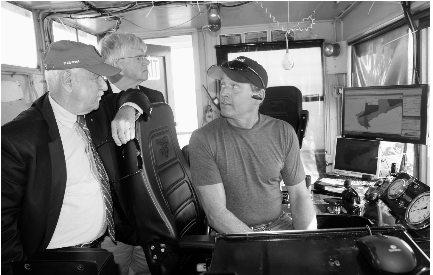
Assemblyman Thiele and Senator Ken LaValle check in on the status of the dredging of the South Ferry channel, linking Shelter Island to North Haven. Periodic maintenance of the ferry channel is necessary to ensure safe passage for travelers utilizing State Route 114. $750,000 in State funding was used to support this project.

You may have also noticed the installation of a new lighted crosswalk near the Hampton Library in Bridgehampton. Senator Ken LaValle and I were able to secure $90,000 for the Town to install this device which will improve pedestrian and driver safety in the busy hamlet. We hope that this project will serve as a model for improved pedestrian safety throughout Long Island.