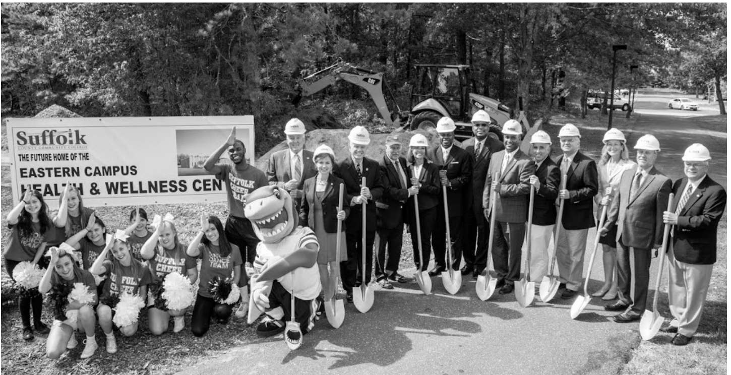
Assemblyman Thiele joins Suffolk County Community College (SCCC) students, faculty and administration at the Groundbreaking of the new Eastern Campus Health and Wellness Center.