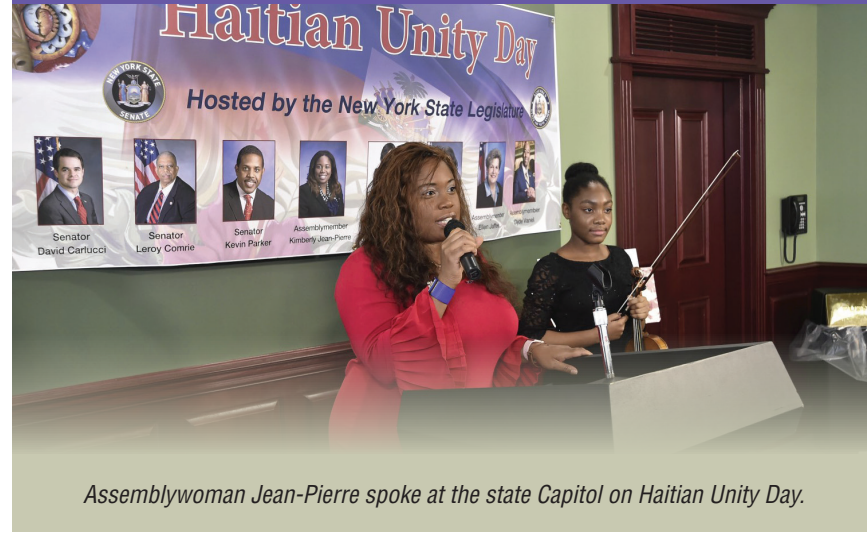
Assemblywoman Jean-Pierre spoke at the state Capitol on Haitian Unity Day.