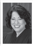
Sonia Sotomayor (1954– )

Heumann is a renowned disability rights advocate. She was confined to a wheelchair after suffering from polio as a child. She fought back against discrimination, becoming the first person in a wheelchair to teach in a New York City public school and helped develop the Individuals with Disabilities Education Act so that all kids with disabilities get the education they deserve.