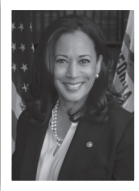
Kamala Harris (1964– )

A Bronx native, Sotomayor graduated from Princeton University and Yale Law School before working as a lawyer and judge in New York City. In 2009, President Barack Obama nominated Sotomayor for appointment to the U.S. Supreme Court. She is the court's first Hispanic and third female justice.