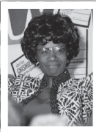
Shirley Chisholm (1924–2005)

Elion, of Manhattan, developed treatments for malaria, meningitis and leukemia. She earned a Nobel Prize in Medicine in 1988, one of only 10 women at the time who had earned a Nobel Prize in the sciences.