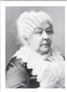
Elizabeth Cady Stanton (1815–1902)

It's important to study women's history because of their contributions to every field, including medicine, law and government. But it's also important to know it took a long time and a lot of hard work for women to enact change and progress. Women had to fight just to own property, earn (and keep) their wages, vote and even go to school.