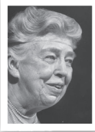
Eleanor Roosevelt (1884–1962)

Tubman escaped slavery in 1849 and became a conductor of the Underground Railroad. She risked her life to rescue slaves to freedom. She purchased land in Auburn in 1859 where she lived the rest of her life.