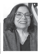
Judith Heumann (1947– )

Born in Brooklyn to immigrant parents, Chisholm was a member of the state Assembly and became the first African-American woman elected to Congress. In 1972, she was the first African-American and first female major-party candidate for the presidency.