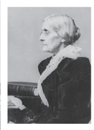
Susan B. Anthony (1820–1906)

A native of Johnstown, NY, she helped organize the first women's rights convention in Seneca Falls and traveled around the world fighting for equality.