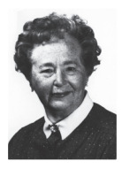
Gertrude B. Elion (1918–1999)

A lifelong New Yorker and first lady of the U.S. from 1933 to 1945, Roosevelt was a speaker and human rights advocate. She fought for disadvantaged Americans and drafted the UN Universal Declaration of Human Rights.