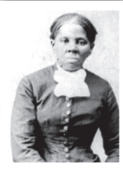
Harriet Tubman (c.1820–1913)

Anthony is one of the most noted women's rights activists in U.S. history, advocating for human rights and helping win the right to vote.