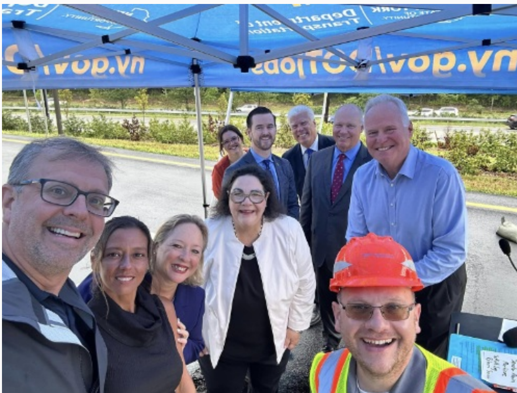
L.I.E. / Sagtikos Parkway Exit 53 Interchange Ribbon