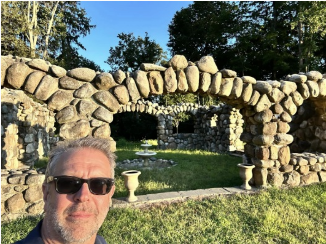
Huntington Annual IPA & Rose Event