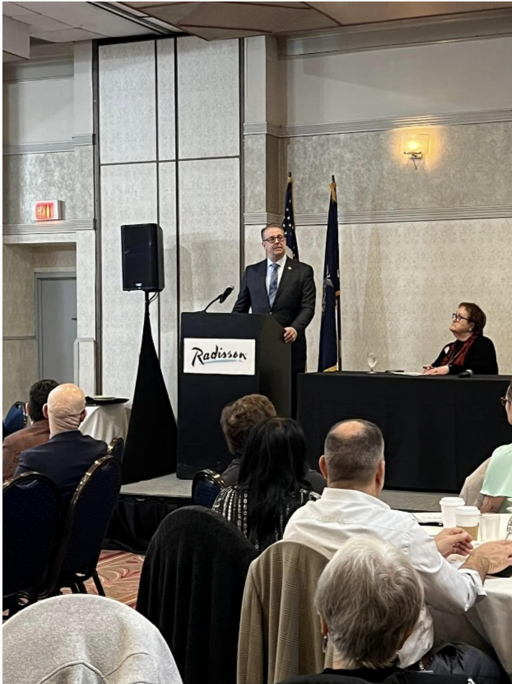
3rd Annual Co-Occurring Disorder Conference