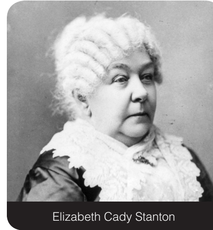
Elizabeth Cady Stanton

On the second day, July 20, abolitionist Frederick Douglass made a powerful speech that unified the two causes of abolishing slavery and improving women's rights. It was also the day that the convention voted on the Declaration of Sentiments. After 68 women and 32 men signed the document making it legitimate, the women's rights movement officially began.