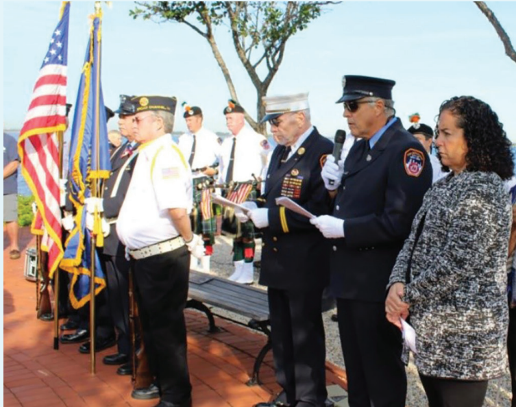
Assemblywoman Pheffer Amato attends a 9/11 Tribute at Tribute Park in Rockaway Park, Queens.

This past legislative session, the New York State Assembly passed my bill (A.10249), which reinstates the 9/11 Worker Protection Task Force. The bill, which received unanimous and bipartisan support from the Assembly and Senate, revives the dormant Task Force to find ways to identify and help first responders and people around the World Trade Center who contracted a 9/11 related illness.