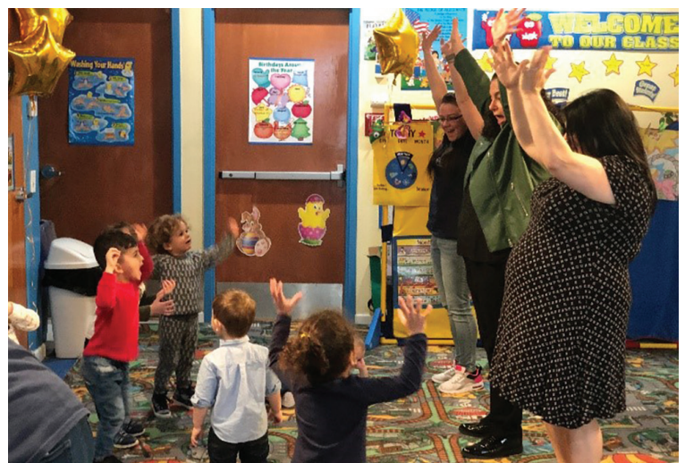
Assemblywoman Pheffer Amato engages with children at a daycare center in Howard Beach, Queens.

This year, new laws (A.6296-A and A.7371 Englebright) went into effect that will protect children from harmful chemicals found in children's products. The new laws allow the New York State Department of Environmental Conservation to review and update the toxic chemicals database, increase reporting standards and frequency for companies who have used chemicals in products to the state, and prohibits the sale, effective January 1, 2023, of children's products containing certain dangerous chemicals including organohalogen flame retardants, tris, and asbestos, amongst other changes.