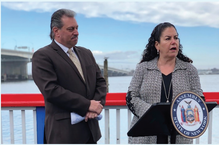
Assemblywoman Stacey Pheffer Amato and Senator Joseph P. Addabbo Jr., at a press conference announcing legislation.