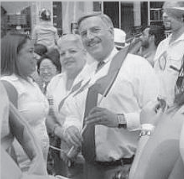
Assemblyman Weprin marches at the 56th Annual National Puerto Rican Day Parade.