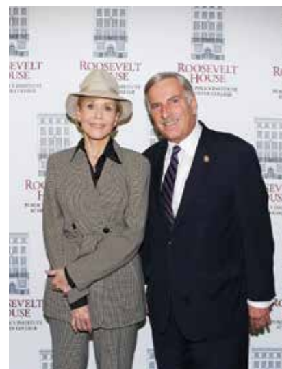
Assemblyman David Weprin and One Fair Wage advocate Jane Fonda.

Assemblyman David Weprin, longtime activist Jane Fonda and Restaurant Opportunities Centers United (ROC United) joined in support of the One Fair Wage campaign which seeks to combat wage inequity, sexual harassment, gender discrimination, and other forms of workplace inequality by eliminating the tipped minimum wage in New York and replacing it with a fair wage for restaurant and other tipped workers.