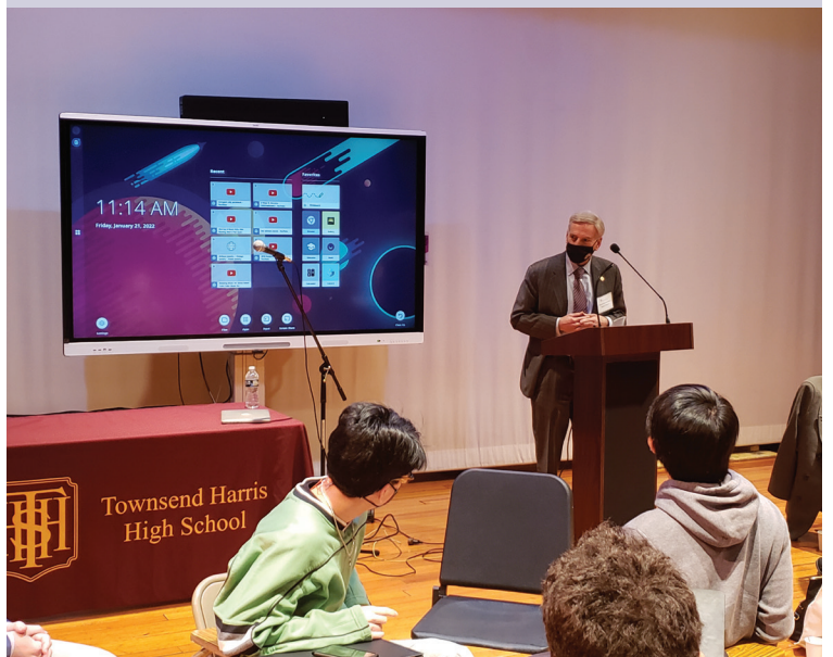
Speaking with students at Townsend Harris High School.

I had a great visit to Townsend Harris High School during their 2022 legislative breakfast, tour, and student roundtable. We were greeted by dozens of students who held group discussions for our edification on various literary works they had read. I was very impressed by the thoroughness and insightfulness of all the young scholars involved! It is always refreshing to meet with the next generation of leaders and I was pleased to answer questions about our state and local government.