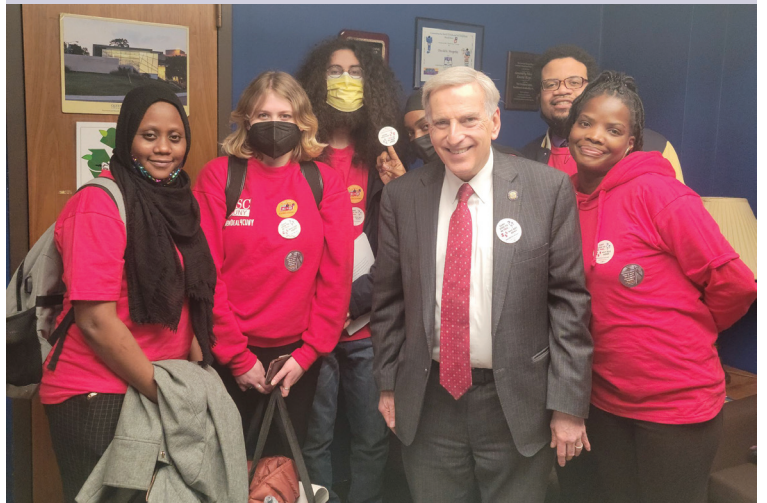
Visiting in the LOB with advocates for higher education.

The Legislative Office Building is always a center of activity during session, with activists and advocates for many different causes stopping by my office to chat. It is my policy that I will meet with anyone who wants to meet, and it was a pleasure to connect with representatives from my district who were fighting for greater investments in the City University of New York (CUNY) and the State University of New York (SUNY). I believe that our public colleges are a model for the rest of the country, and we made historic funding increases this year with investments including $60 million in state operating support funds for SUNY and $60 million for CUNY, as well as $159 million to hire additional full-time faculty at four-year colleges and community colleges. The Assembly Majority has long been dedicated to making college affordable. This budget also increases state support in operating revenue to raise the amount campuses receive for Excelsior Scholarship recipients by $13.7 million for SUNY state operated campuses, $2.1 million for SUNY community colleges and $2.8 for CUNY senior colleges, for a total of $18.6 million.