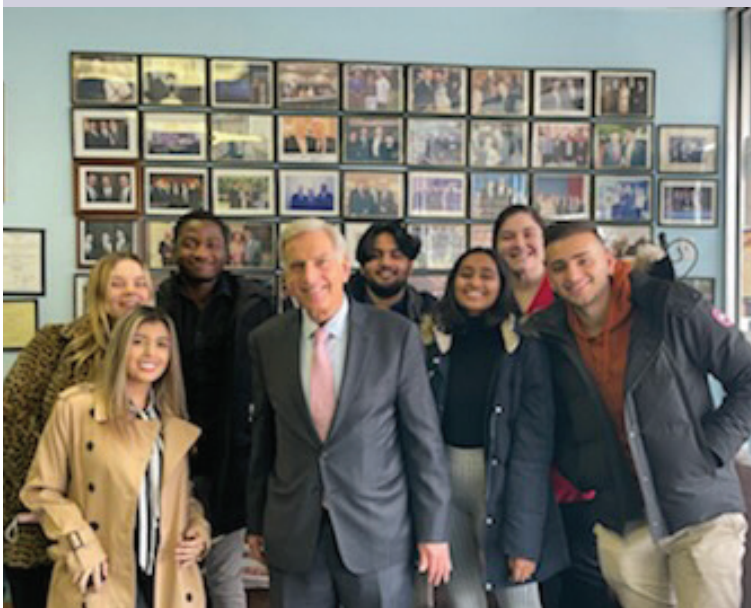
Welcoming a delegation of St. John's University students to my District Office in Fresh Meadows.

It was a pleasure to welcome a delegation of students from St. John's University to my Fresh Meadows District Office. These committed young folks briefed my staff and me about a bill that is up for consideration this session and I gave them advice on best practices to push this legislation toward passage. One of the most rewarding parts of my role as Assemblyman is the opportunity to meet with the leaders of tomorrow!