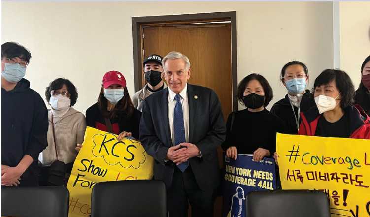
Meeting with constituents in the Legislative Office Building.

Many fantastic visitors come through our doors in Albany, and I'm always grateful to meet with the passionate advocates who help keep legislators like me informed on issues of concern. Representatives from Korean Community Services stopped by my office and shared many moving stories from their members. Too many New Yorkers struggle to make ends meet, which is why we need to pass the #Coverage4All Act. I am committed to fighting for the health of all New Yorkers – including the undocumented and uninsured.