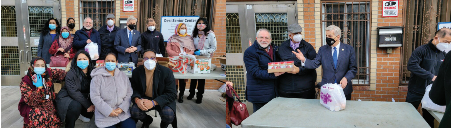
I gathered at the Jamaica Muslim Center in partnership with India Home, the Met Council, and members of the State Senate and Assembly.

Food insecurity is a problem across New York, and my office hosted a Can Drive with multiple elected and community partners across Eastern Queens to do our part in alleviating hunger. After weeks of collecting nonperishable items, we gathered at Jamaica Muslim Center to hand out cans and hot food that was provided by India Home. It is so important to give back to the community and help in a tangible way. Jamaica Muslim Center has graciously opened their doors to not only the Muslim community at large but to all who come to their doors.