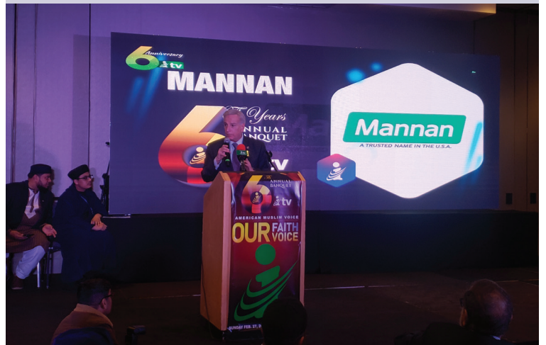
Speaking at the ITV6 Annual Banquet.

I attended the ITV USA 6th Anniversary Banquet as a "Guest of Honor" this year. ITV USA has served the Islamic community in the New York Metropolitan area for 6 years, and we came together to celebrate their message and to honor their successes. After giving remarks, I presented proclamations to the leadership at ITV USA, lauding their 24/7 outreach to over 2 million viewers. This was a wonderful night of cultural sharing and I look forward to seeing ITV USA grow in the years to come.