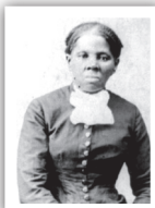
Harriet Tubman (c.1820–1913)

Anthony is one of the most noted women's rights activists in U.S. history, helping set up the Seneca Falls Convention and win the right to vote.