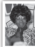
Shirley Chisholm (1924–2005)

Elion, of Manhattan, developed treatments for malaria, meningitis and leukemia. She earned a Nobel Prize in Medicine in 1988, one of only 10 women at the time who had earned a Nobel Prize in the sciences.