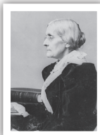
Susan B. Anthony (1820–1906)

A native of Johnstown, she helped organize the first women's rights convention in Seneca Falls and traveled around the world fighting for equality.