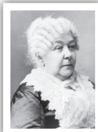
Elizabeth Cady Stanton (1815–1902)

It's important to study women's history because of their contributions to every field, including medicine, law and government. But it's also important to know it took a long time and a lot of hard work for women to get where they are today. Women had to fight first just to own property, earn (and keep!) their wages, vote and even go to school.