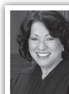
Sonia Sotomayor (1954– )

Heumann is a renowned disability rights advocate. She was confined to a wheelchair after suffering from polio as a child. She fought back against discrimination, becoming the first person in a wheelchair to teach in a New York City public school and helped develop the Individuals with Disabilities Education Act so that all kids with disabilities get the education they deserve.