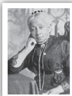
Gertrude B. Elion (1918–1999)

A lifelong New Yorker and first lady of the U.S. from 1933 to 1945, Roosevelt was a speaker and human rights advocate. She fought for disadvantaged Americans and drafted the UN Universal Declaration of Human Rights.