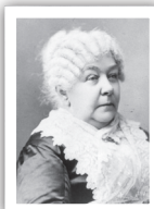
Elizabeth Cady Stanton (1815–1902)

It's important to study women's history because of their contributions to every field, including medicine, law and government. But it's also important to know it took a long time and a lot of hard work for women to enact change and progress. Women had to fight just to own property, earn (and keep) their wages, vote and even go to school.