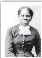
Harriet Tubman (c.1820–1913)

Anthony is one of the most noted women's rights activists in U.S. history, helping set up the Seneca Falls Convention and win the right to vote.