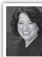
Sonia Sotomayor (1954– )