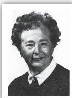
Gertrude B. Elion (1918–1999)

A lifelong New Yorker and first lady of the U.S. from 1933 to 1945, Roosevelt was a speaker and human rights advocate. She fought for disadvantaged Americans and drafted the UN Universal Declaration of Human Rights.