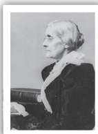
Susan B. Anthony (1820–1906)

A native of Johnstown, NY, she helped organize the first women's rights convention in Seneca Falls and traveled around the world fighting for equality.