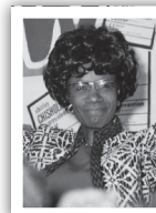
Shirley Chisholm (1924–2005)

Elion, of Manhattan, developed treatments for malaria, meningitis and leukemia. She earned a Nobel Prize in Medicine in 1988, one of only 10 women at the time who had earned a Nobel Prize in the sciences.