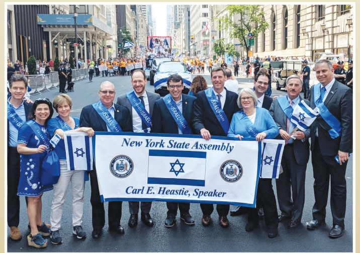
Assemblyman Braunstein marched in the Celebrate Israel Parade in Manhattan, the world's largest public event celebrating Israel's 71st anniversary.