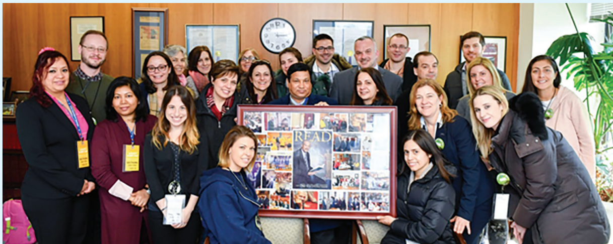
Members of the United Federation of Teachers from New York City came up to Albany in March on their Lobby Day.

It supports English Language Learners by including $2.8 million in increased support for students who face language barriers, as well as $2 million for bilingual education grants. The budget allocates a total of $17.5 million to support students who do not have English as their first language. There is an additional $770,000 for training programs to increase the number of teachers providing bilingual and multilingual education.