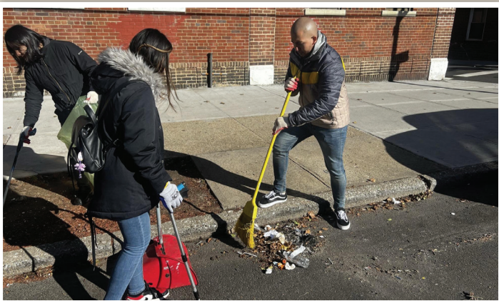
Team Juan joined the local organization Woodside on The Move to help clean our streets and beautify our parts of Woodside!