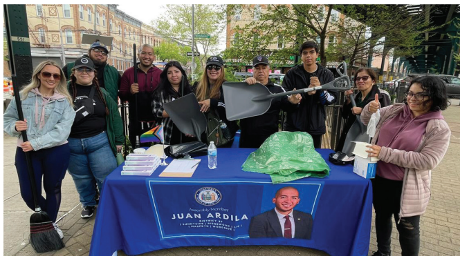
Our office joined forces with local Ridgewood neighbors to beautify Rosemary's Playground and the surrounding Streets for Earth Day.

For Earth day, our office hosted a community clean – up in Ridgewood. Thank you to all our neighbors that joined! We will be hosting more in the future, so please stay tuned. Our office is determined to fight in Albany and on the ground to promote a cleaner, greener environment while combatting climate change. That is why I am committed to support legislation that seeks to do just that. We must ensure a flourishing planet Earth for all New Yorkers and for future generations to come.