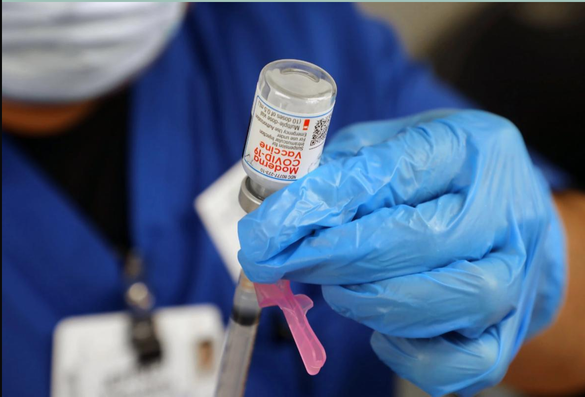
A dose of the Moderna vaccine being filled into a syringe in Mountain View, Calif., on Friday.