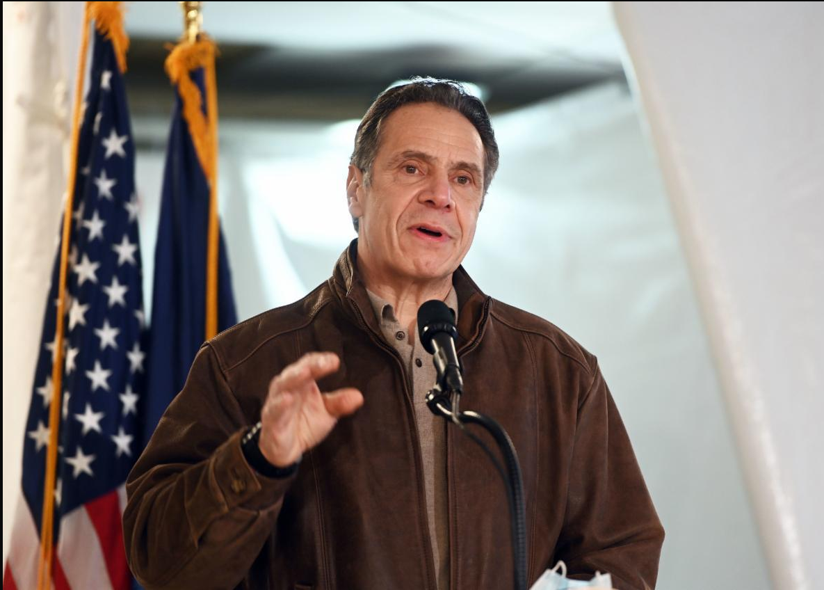
Photo Credit: Governor Andrew M. Cuomo visits NYCHA Vaccine Pop-Up Site in Brooklyn