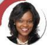
Rodneyse Bichotte Hermelyn Assemblymember, Assembly District 42