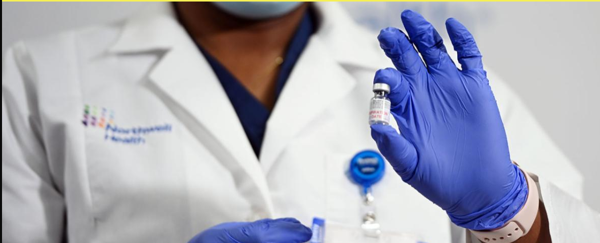
Governor Cuomo Announces 12 Community-Based Pop-Up Vaccination Sites Coming Online..