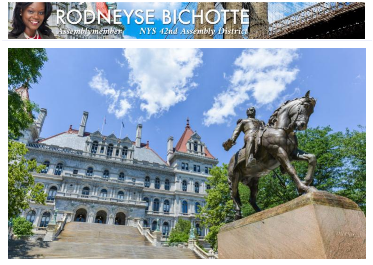
The state Capitol in Albany.