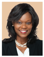
Assemblymember RODNEYSE BICHOTTE HERMELYN

1312 Flatbush Avenue Brooklyn, New York 11210