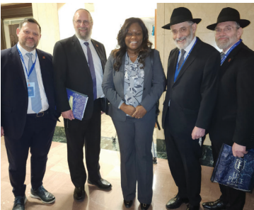
Meeting with leaders of Agudath Israel of America to discuss pressing issues facing our Jewish communities.