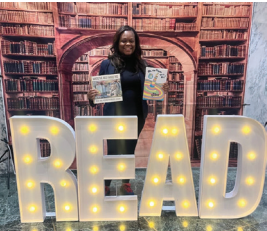
Assemblymember Bichotte Hermelyn called for increased resources for libraries, to empower all New Yorkers during Library Advocacy Day , hosted by NYS Senator Siela A. Bynoe , and joined by advocates across NYS.