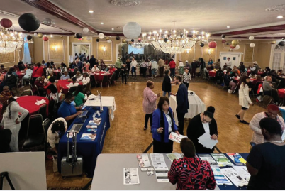
(Pictured are seniors enjoying food and games.)