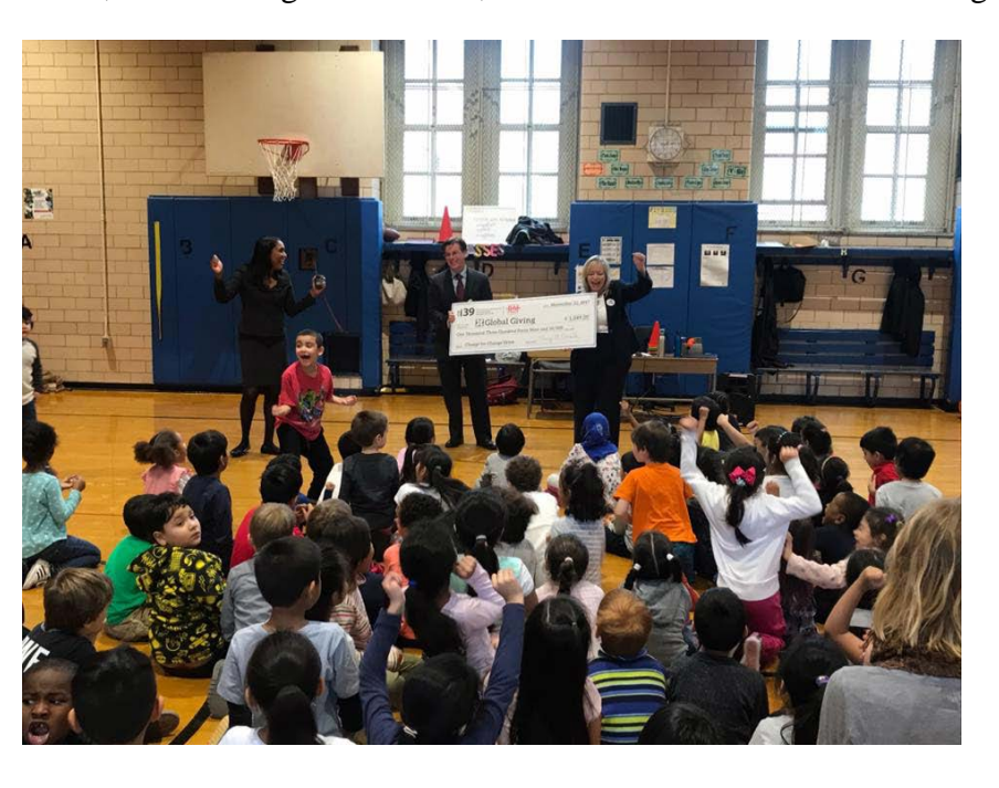
I joined the 1<sup>st</sup> Grade Class at an assembly at PS 139 last week to congratulate them for raising the most money in the entire school! It was heartwarming to celebrate the generosity of some of our youngest citizens for those in need.

The wonderful students and PS 139 community concluded their highly successful "Change 4 Change" drive, which brought in over $1,300 for children in need from Bangladesh, Mexico and Puerto Rico.