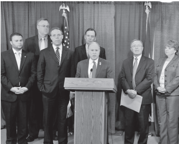
Assemblyman Colton is seen here flanked by members of the NYS Assembly and Senate to announce the introduction of a bill to end a burdensome tax for our veterans. Assemblyman Colton teamed up with Senator DeFrancisco (R-Syracuse) to unite bi-partisan support for the bill. The bill currently has 55 sponsors in the Assembly, where it awaits legislative action.