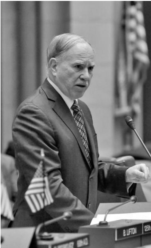
Assemblyman Colton is seen here debating on the floor of the NYS Assembly.