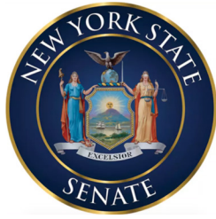
SIMCHA FELDER NEW YORK STATE SENATOR 17TH DISTRICT