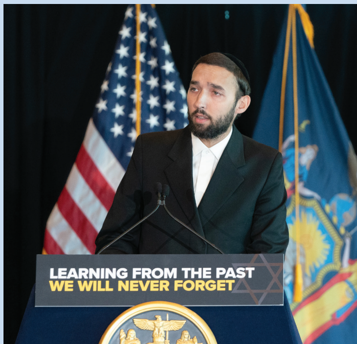
Assemblyman Simcha Eichenstein Speaking at Governor Hochul's Bill Signing Ceremony

Assemblyman Eichenstein's district includes the largest number of Holocaust survivors in the nation and he is keenly attuned to their needs. "Our elderly survivors who have endured so much should not be charged corporate transaction fees for payments that are rightfully theirs," he said. "They deserve better."