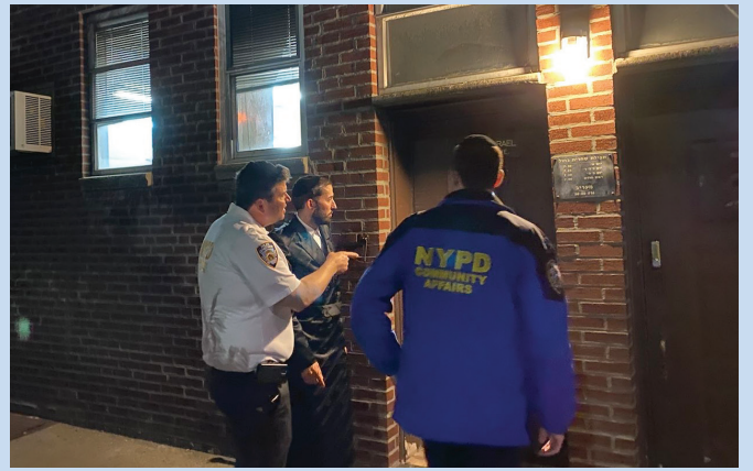
Assemblyman Simcha Eichenstein on the scene of a recent hate crime incident with NYPD personnel

"Victims of hate crimes should not be victimized a second time due to their insurer's decision refusing to renew their policies or increasing their premiums," said Assemblyman Eichenstein. "This legislation would ensure that their coverage remains intact."