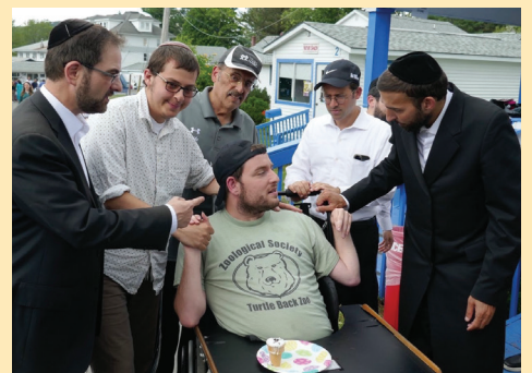
At Camp HASC - “The Happiest Place On Earth”