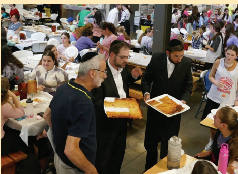
Pizza Day at Camp Kaylie

“Our visit to Camp HASC and Camp Kaylie was an inspiring and uplifting experience,” said Assemblyman Eichenstein. “Every child, no matter their ability, deserves a memorable and incredible summer experience which is only possible thanks to the dedicated staff at these unique camp programs.”