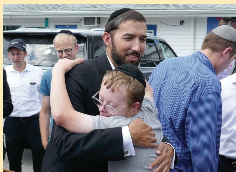
Campers Greeting Assemblyman Eichenstein