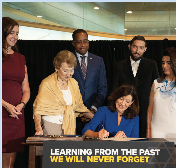
Governor Kathy Hochul Signs Assemblyman Simcha Eichenstein's Legislation Protecting Holocaust Survivors