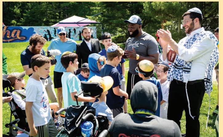
NFL superstar Leonard Fournette huddles with campers on the field prior to game time