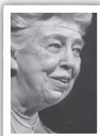
Eleanor Roosevelt (1884–1962)

Tubman escaped slavery in 1849 and became a conductor of the Underground Railroad. She risked her life to rescue slaves to freedom. She purchased land in Auburn in 1859 where she lived the rest of her life.