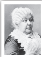
Elizabeth Cady Stanton (1815–1902)

It's important to study women's history because of their contributions to every field, including medicine, law and government. But it's also important to know it took a long time and a lot of hard work for women to enact change and progress. Women had to fight just to own property, earn (and keep) their wages, vote and even go to school.