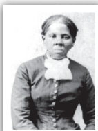
Harriet Tubman (c.1820–1913)

Anthony is one of the most noted women's rights activists in U.S. history, advocating for human rights and helping win the right to vote.