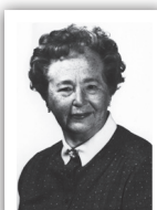
Gertrude B. Elion (1918–1999)

A lifelong New Yorker and first lady of the U.S. from 1933 to 1945, Roosevelt was a speaker and human rights advocate. She fought for disadvantaged Americans and drafted the UN Universal Declaration of Human Rights.