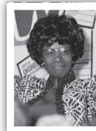
Shirley Chisholm (1924–2005)

Elion, of Manhattan, developed treatments for malaria, meningitis and leukemia. She earned a Nobel Prize in Medicine in 1988, one of only 10 women at the time who had earned a Nobel Prize in the sciences.