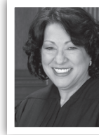
Sonia Sotomayor (1954– )

Heumann is a renowned disability rights advocate. She was confined to a wheelchair after suffering from polio as a child. She fought back against discrimination, becoming the first person in a wheelchair to teach in a New York City public school and helped develop the Individuals with Disabilities Education Act so that all kids with disabilities get the education they deserve.