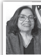
Judith Heumann (1947– )

Born in Brooklyn to immigrant parents, Chisholm was a member of the state Assembly and became the first African-American woman elected to Congress. In 1972, she was the first African-American and first female major-party candidate for the presidency.