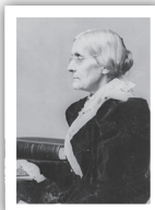
Susan B. Anthony (1820–1906)

A native of Johnstown, NY, she helped organize the first women's rights convention in Seneca Falls and traveled around the world fighting for equality.