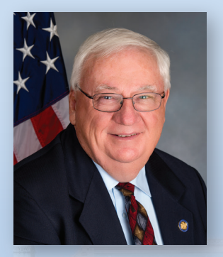
Senator JOHN BROOKS