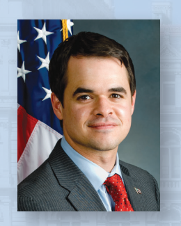
Senator DAVID CARLUCCI