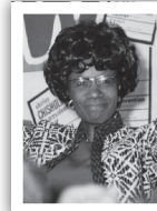
Shirley Chisholm (1924–2005)

Elion, of Manhattan, developed treatments for malaria, meningitis and leukemia. She earned a Nobel Prize in Medicine in 1988, one of only 10 women at the time who had earned a Nobel Prize in the sciences.