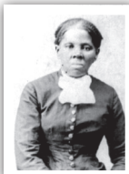
Harriet Tubman (c.1820–1913)

Anthony is one of the most noted women's rights activists in U.S. history, advocating for human rights and helping win the right to vote.