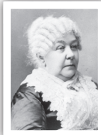
Elizabeth Cady Stanton (1815–1902)

It's important to study women's history because of their contributions to every field, including medicine, law and government. But it's also important to know it took a long time and a lot of hard work for women to enact change and progress. Women had to fight just to own property, earn (and keep) their wages, vote and even go to school.