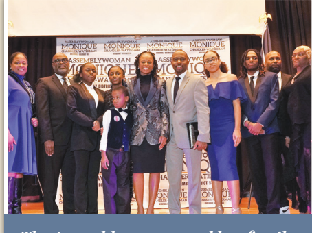
The Assemblywoman and her family