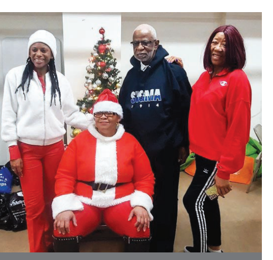
The Jimerson-Gorman Houses Holiday Toy Giveaway sponsored by the Assemblywoman was a festive event celebrated by the community.