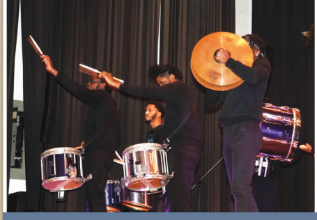
Blue Angels Drumline