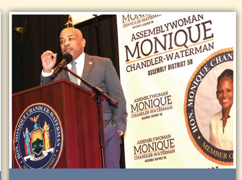
NYS Assembly Speaker Carl Heastie