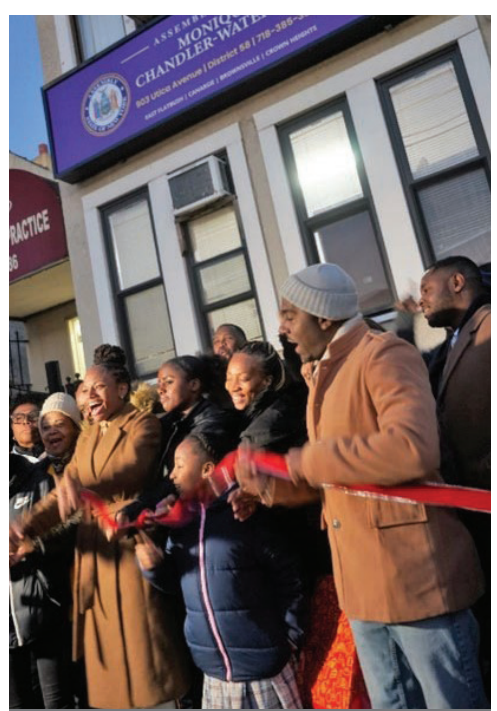
Assembly District 58 Ribbon Cutting and Community Open House.