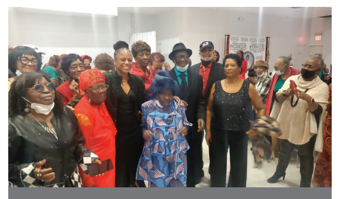
First Annual District 58 Older Adults Holiday was hosted by Abe Stark Older Adult Center, Ft. Greene Council, Inc, Glenwood Older Adult Center, J-Loft, and Sundance SADC Inc. Adult Day <u>Center. Th</u>e event was great!