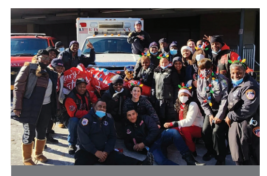
Christmas Day Toy Distribution on the pediatric units of local hospitals Brookdale, Downstate and Kings County organized by Steel Horses Motorcycle Club BKLYN N.Y. and the New York City Fire Department (FDNY).