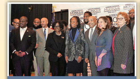
Elected officials from Brooklyn and beyond attended the Inauguration event