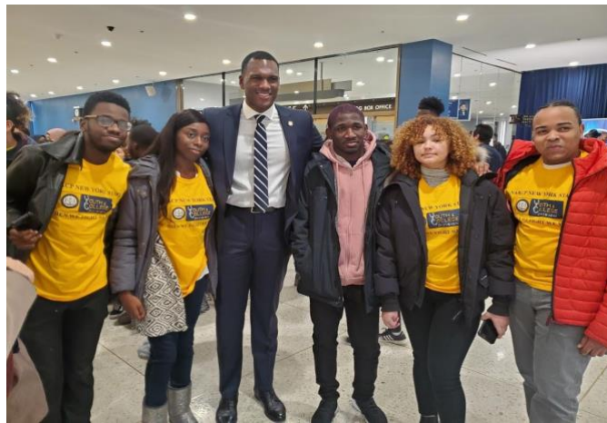
(NYSABPRL Youth Conference, February 2020)

Though I understand that difficult decisions must be made by the city administration during this challenging time, when we have to choose between using taxpayer dollars to fund political campaigns or funding programs to benefit our students and community, our youth should always be our priority. NYC campaign finance matters should be revisited at a later date when the economy is in a healthier place. For several months, many of us have been working from home, and our students have been learning virtually. I am confident that government and community organizers can work together to create outlets for our SYEP participants to successfully work from home and continue supporting students and families that rely on our community schools.