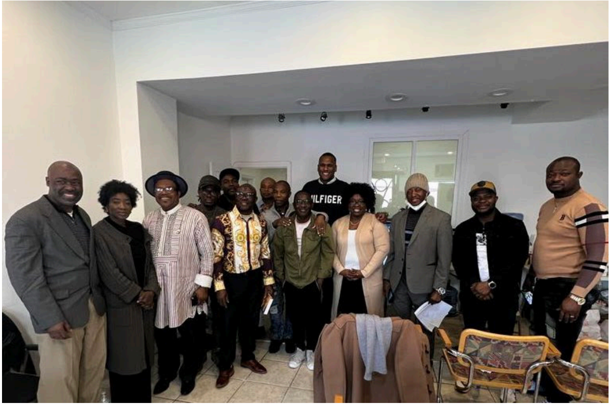
Glad to stop by and check in on my neighbors at the African Political Action Committee - thank you for all that you do!