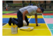
We are an Equal Opportunity Employer.