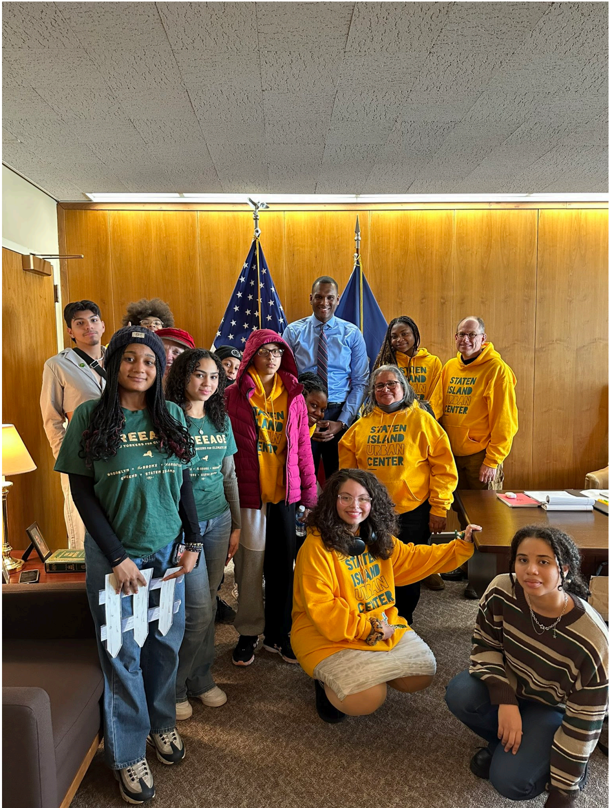
Great visit from members of the Staten Island Urban Center and TREEAge team advocating for a clean economy, union jobs and strengthening urban environment through youth & community