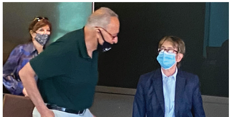
In July, I welcomed the opportunity to host a discussion with U.S. Senate Majority Leader Chuck Schumer and a small group of community leaders so he could hear about issues affecting the district as we recover from the pandemic.

However, we cannot simply build our way out of this problem. The production of concrete releases carbon dioxide, a potent greenhouse gas, and currently there is no means of construction that offsets its negative environmental impact. Addressing climate change by implementing more