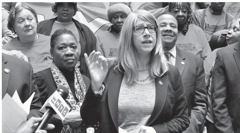
Assemblymember Rosenthal stood up for tenants this session as they fought to strengthen and renew the rent laws. Here she is with hundreds of tenants gathered in Albany for a rally.

In the past, landlords were able to harass their rent-regulated tenants and force them to leave. Once the unit became vacant, the landlords could claim to have made thousands of dollars' worth of improvements to get to the deregulation limit. With little oversight in place to prove the veracity of these claims, landlords were easily able to "legally" deregulate a unit. With this change in place, the rent must increase to $2,700 while the tenant lives in the unit. Only then can a landlord apply to deregulate a unit. This means that landlords will no longer be able to claim improvements that were never made, and it also removes the incentive for landlords to harass their rent-regulated tenants into leaving.