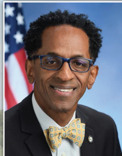
Al Taylor State Assemblymember