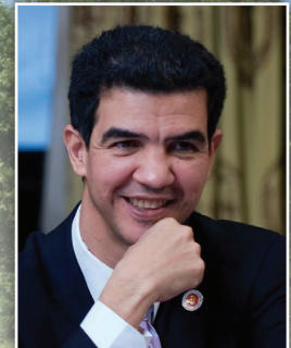
Ydanis Rodriguez NY City Councilmember