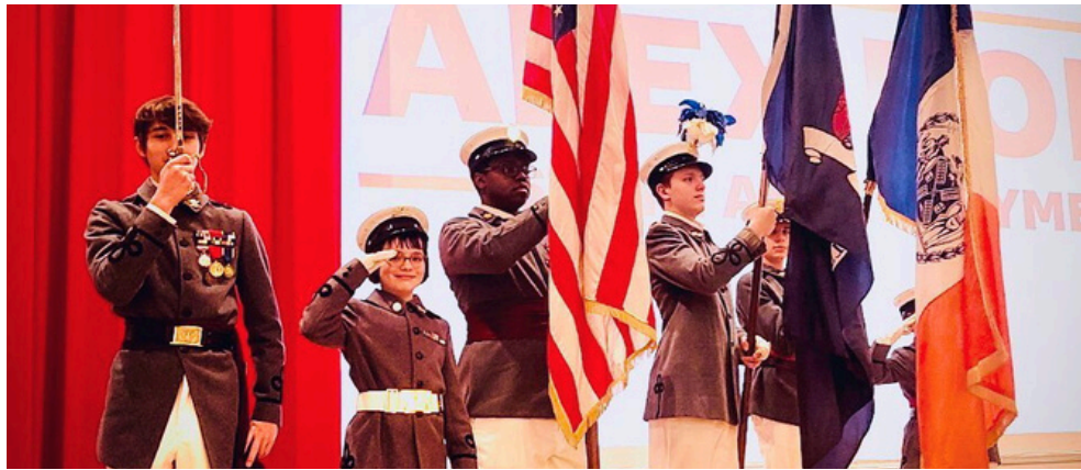
Governor Hochul signed two bills introduced by the Assemblymember