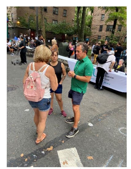
The Fulton Houses Family Day is always a great opportunity to make community connections and enjoy the summer!