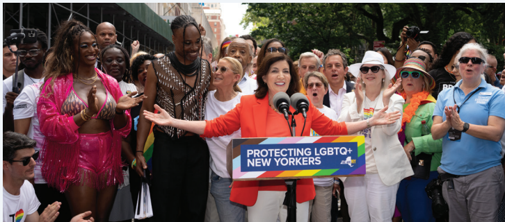
Governor Hochul after signing my legislation removing homophobic language from state law as well as the Transgender Safe Haven Act!

Protecting Interns: The Assembly unanimously passed my bill, A.7355, to protect unpaid interns from discrimination based on gender identity or expression. Interns are vulnerable members of the workforce and ensuring they receive the same protections as all employees is critical to their safety and future success.