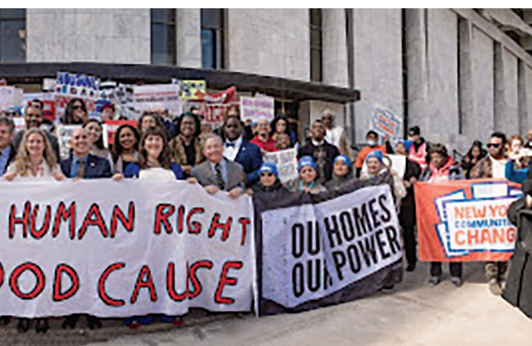
and Cause Eviction.

ments, creating new incentives for deeper affordability levels, findings in all communities across the state. Bringing new tools use. It is a crisis we must solve so all New Yorkers can afford