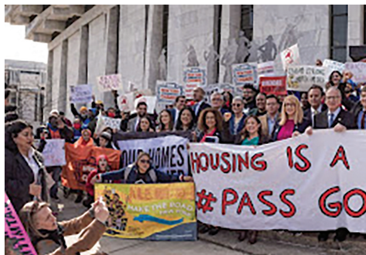
Rallying in Albany with hundreds of tenants and colleagues to pass Good Cause Eviction

We also must begin creating the affordable housing of tomorrow, because we needed it yesterday. There are so many available tools to increase the housing supply that we can not just meet, but exceed demand and lower rent costs. I support converting empty office buildings to residential, legalizing basement apartments, mandating development in the suburbs around commuter train stations, and making it easier to build small apartment buildings. The State will allow creation of significant new affordable housing to tackle the crisis. We don’t have a moment to lose to live here and have a home.