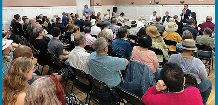
I held my first town hall meeting at Hartley House in Hell's Kitchen with over one hundred of our neighbors joining to discuss a wide range of issues.