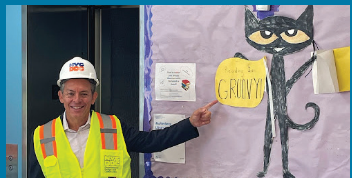
Surveying construction at Muhlenberg Library in Chelsea which is slated to reopen next year after HVAC improvements, elevator repairs, sidewalk improvements and a new fire alarm system.