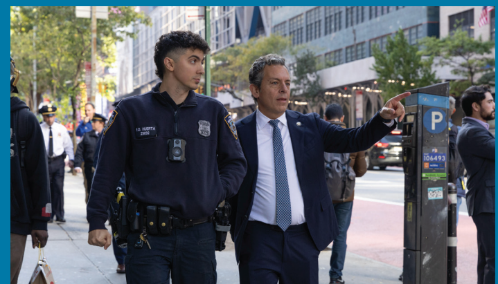
Walking West 42nd Street with the NYPD during a public safety walkthrough organized by my office.